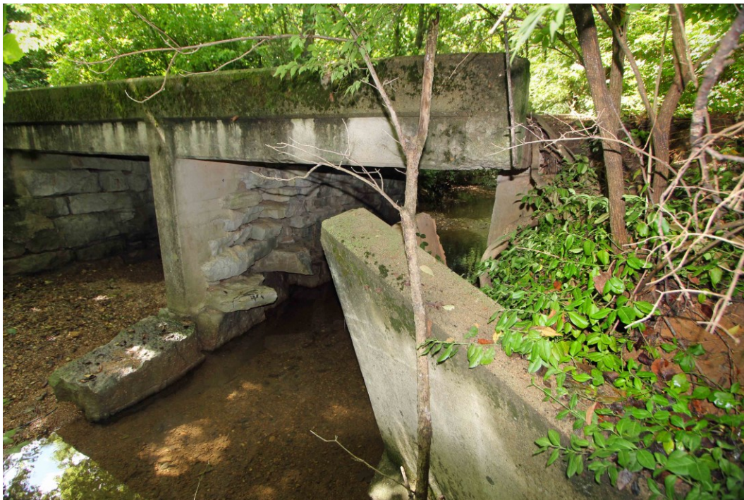
Historic Rock Pillar Bridge built on the route of the original Emery Road is now in dire need of preservation efforts to prevent the southeast concrete retaining wall from falling in the creek